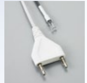
Fixed Pin Connector