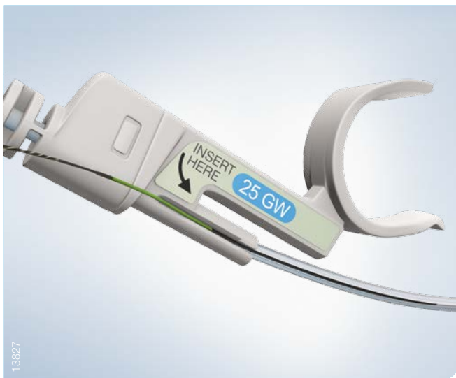
Port design facilitates guidewire insertion.

Supports effortless device exchange for short-wire or traditional over-the-wire techniques. It is designed for use in combination with the VisiGlide line of guidewires to enable smooth instrument exchange.